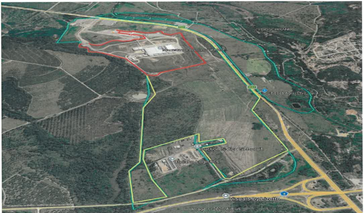
Figure 1: Layout of the MIF property

MIF site is located in the Mpumalanga Province in the City of Mbombela Local Municipality. The site can be accessed through the R37 road to Lydenburg or through the R40 road to White River. The site location can also be described by the following coordinates: Latitude: 30° 56' 28.37" S and Longitude: 25° 26' 05.60" E