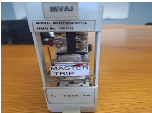
Figure 2 Master Trip Relay