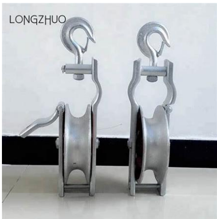
Figure 4 Hanging Cable roller Wheel