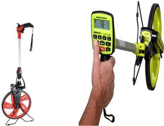
Figure 1 Measuring Wheel