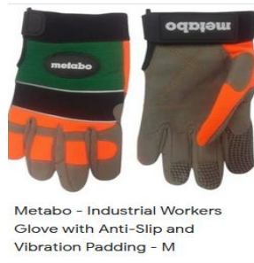
Metabo - Industrial Workers Glove with Anti-Slip and Vibration Padding - M