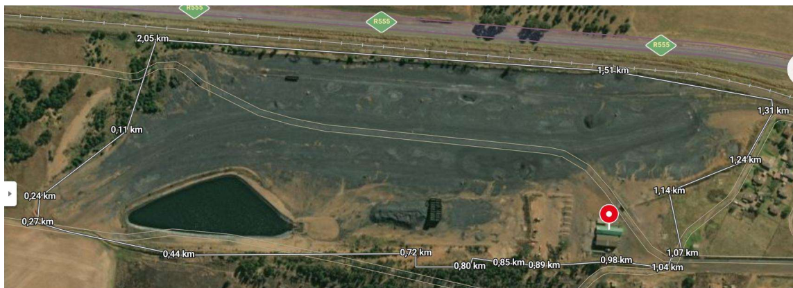
Figure 1: Kendal siding in Mpumalanga

Kendal inland terminal strategically operates through TFR rail siding logistic chain. The terminal handles coal cargo received via road trucks to be railed for domestic and export purposes. The site has a capacity to handle 2, 5 million tons per annum. Cargo is offloaded from road trucks into designated stockpiles and loaded onto rail wagons utilising the terminal’s materials handling equipment.