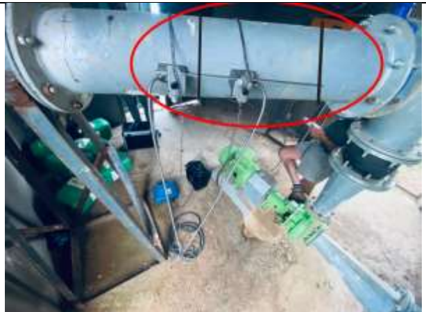
FIGURE 5: PROPOSED ABSTRACTION POINT 2 METER LOCATION

4.6. Typical standard details (Please note that this is being provided for guidance only. The PSP is expected to carry out their own independent designs and come up with site specific detail drawings)