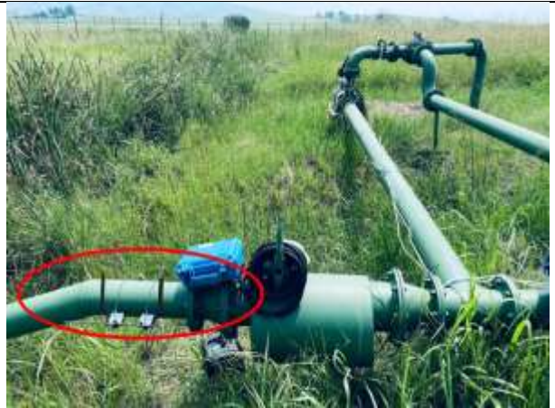
FIGURE 3: PROPOSED ABSTRACTION POINT 1 METER LOCATION