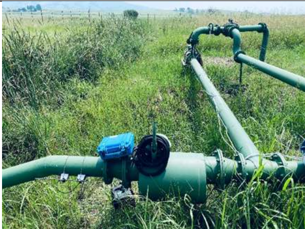
FIGURE 2: ABSTRACTION POINT 1