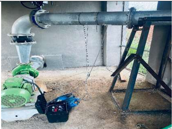
FIGURE 4: ABSTRACTION POINT 2