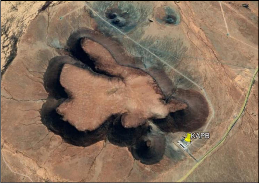
Figure 1: On site location

The proposed location of the RFI monitoring station is atop Losberg hill located northwest of the Karoo Array Processing Building (KAPB) on the Karoo site, approximately 90 km from Carnarvon in the Northern Cape.