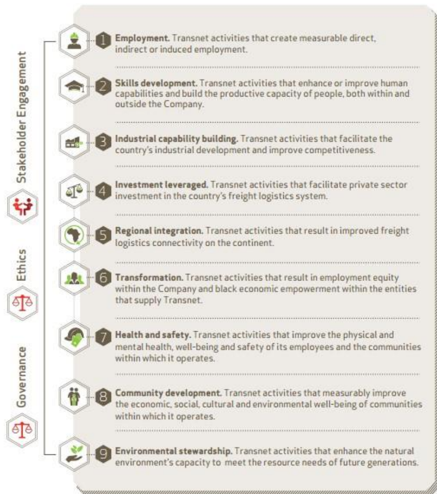
Figure 1: Sustainable Development Outcomes

3.2 The following are the project deliverables: the Service Provider will ensure that applicable Acts and all applicable regulations are adhered to. It is important that the execution of this phase by the Service Provider/s should ensure that EACH identified building per province per site per buildings are assessed individually and the final report should deal and include the following amongst other requirements per province per site per building(s):