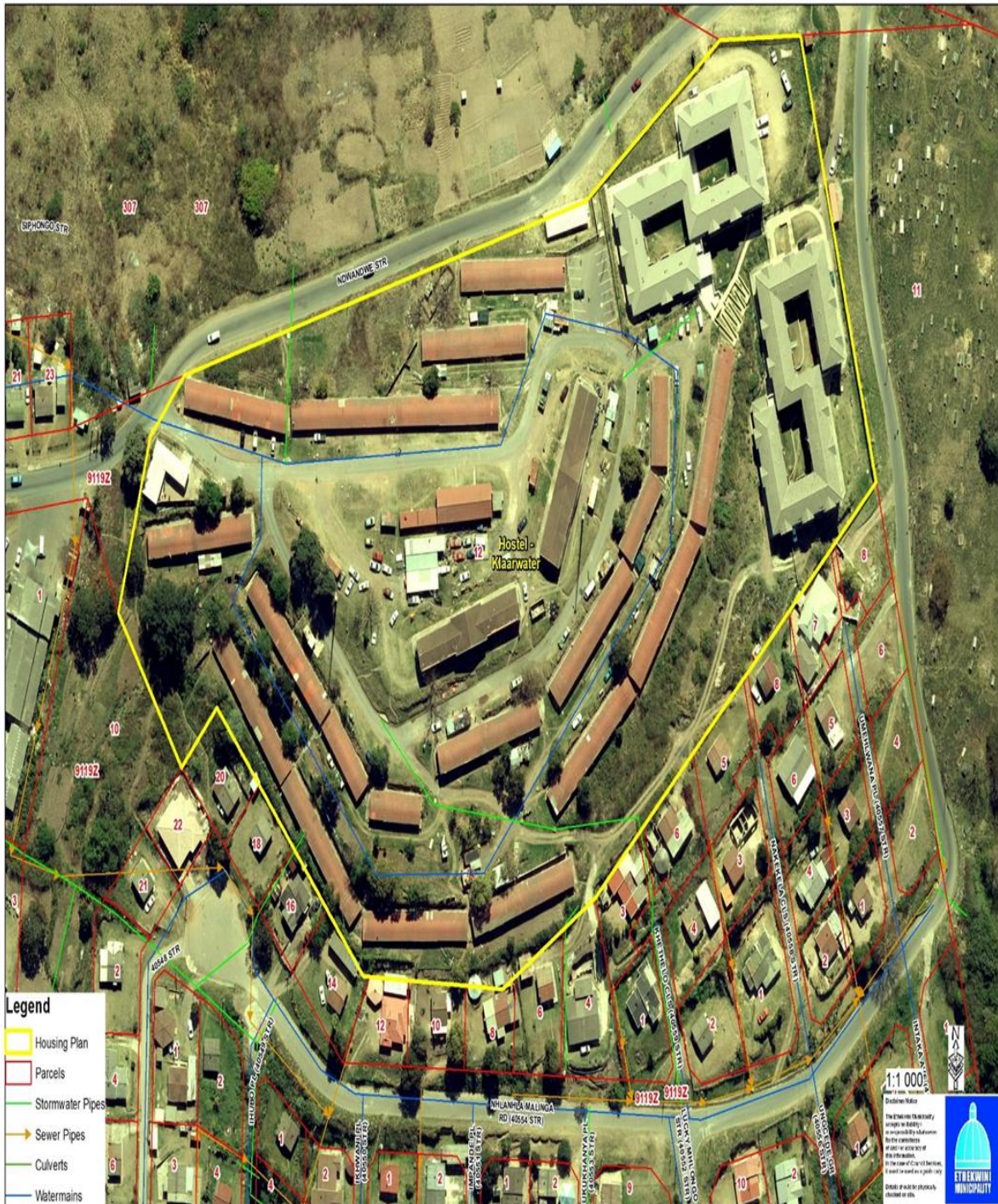
Hostel - Klaarwater