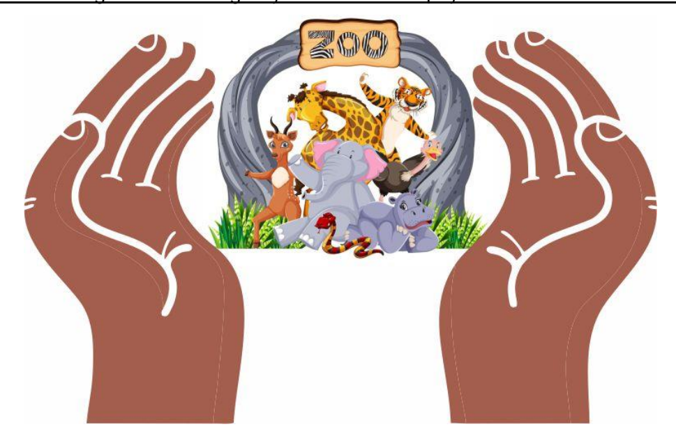
Principle - Protecting Johannesburg City Parks and Zoo physical assets and animals

Proactively sharing successful means of enhancing any and all aspects of efficiency or service quality with management and other employees in order to maximize the benefits.