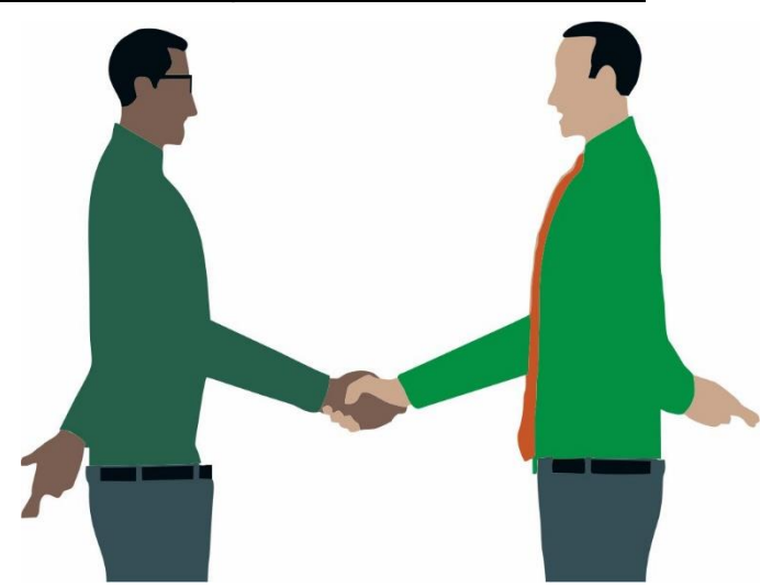
Principle - Avoiding both actual and perceived conflicts of interest

For the purposes of the code, conflict of interest exists where a Non– Executive Director or an Executive Manager, or any other employee has a relationship with either a natural or juristic person doing or intending to do business with JCPZ.