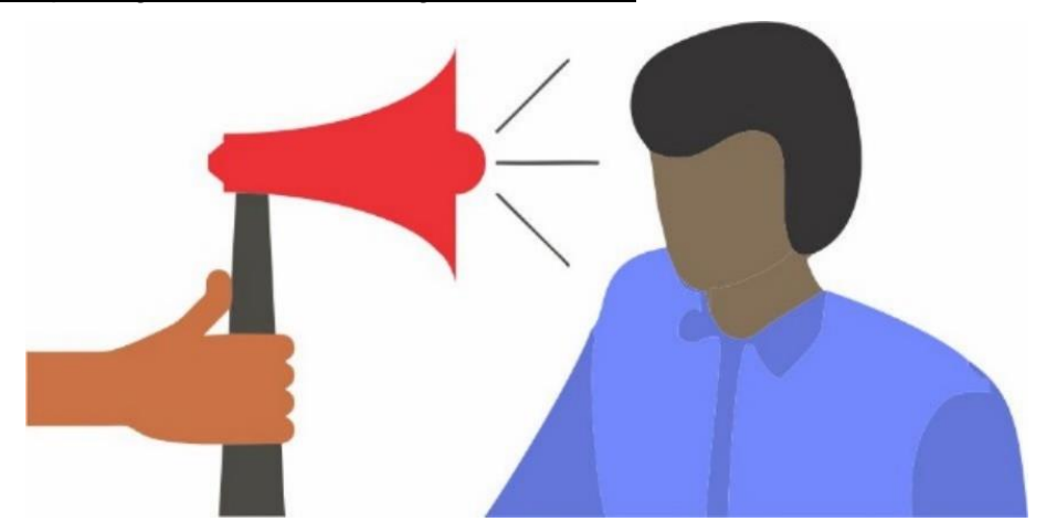
Principle - Reporting unethical and dangerous conduct

It is vital that employees and stakeholders support this Code and it is encouraged that there should be disclosure of unethical behavior the first time it comes to light. JCPZ is committed to having an environment where employees and stakeholders can raise concerns or enquire on perceived transgression without fear of prejudice.