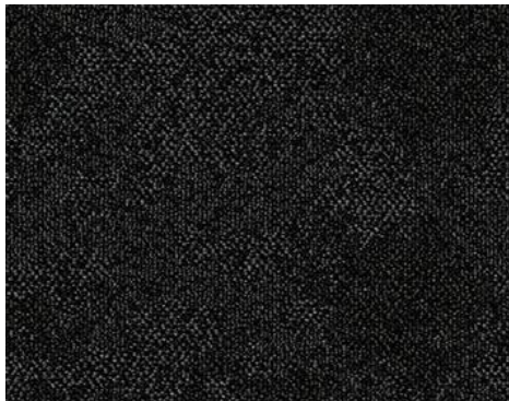
Figure 3: The requires carpet tile