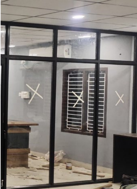
Figure 2: Similar representation of what is required.