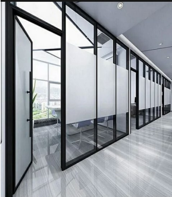
Figure 1: Similar representation of what is required with a sliding door.