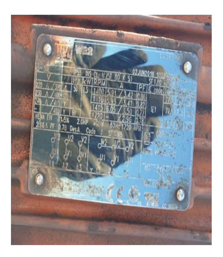
Figure 2: Motor plate