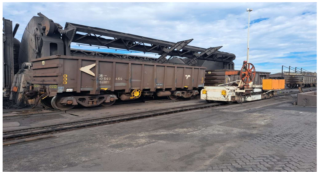
Figure 1: Charger positioning the wagon