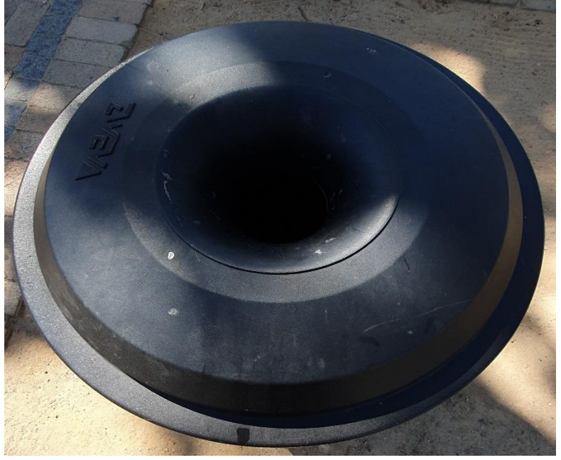
Figure 2: Top view