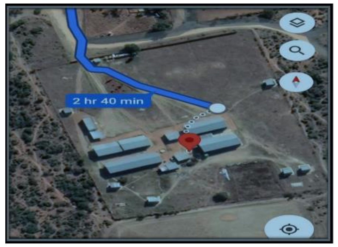
Figure 1: MADIPOANE SECONDARY SCHOOL

The approximate localities of the schools are as indicated on the attached Locality Plan.