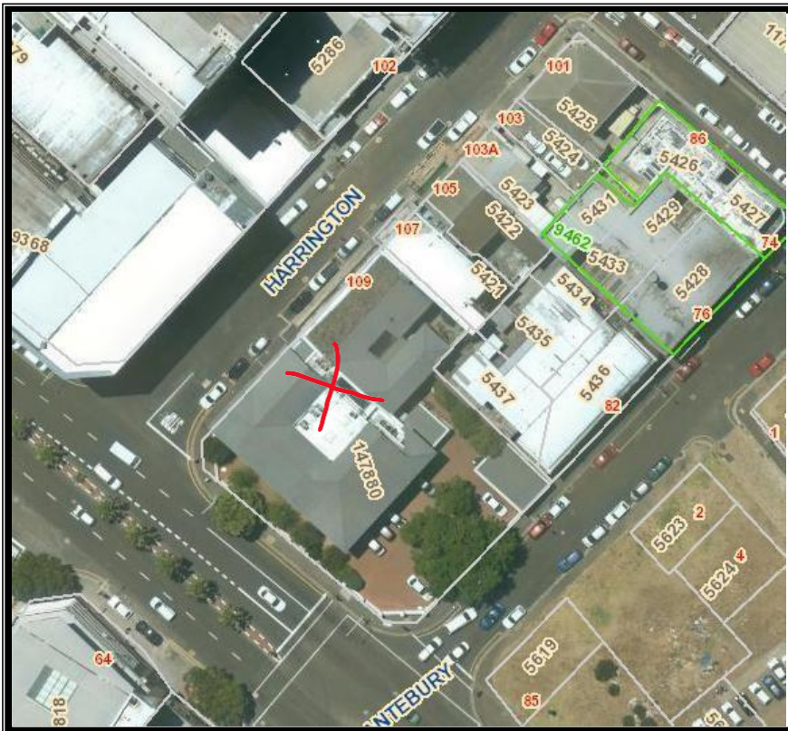
Figure 1: Locality map: Erf 147880, 109-111 Harrington Street, SAHRA office