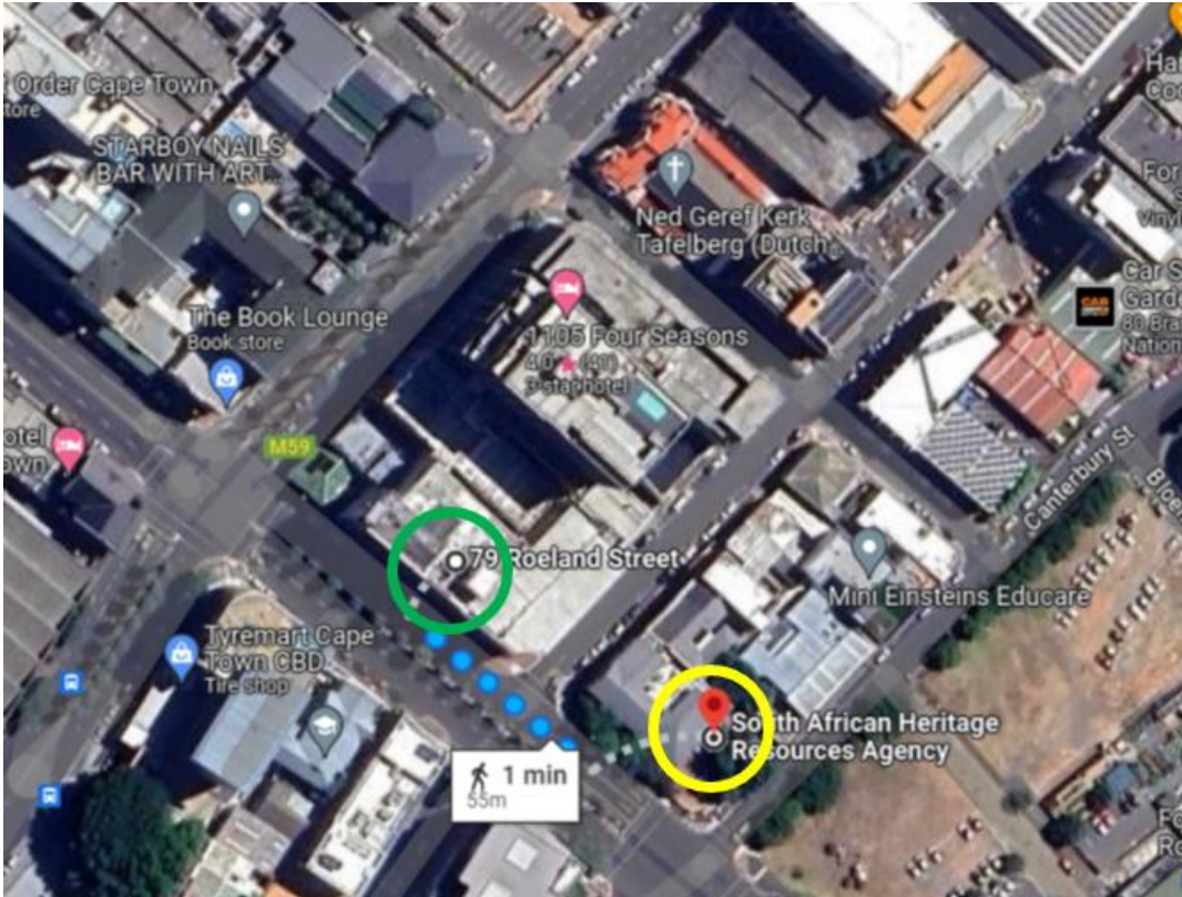
Figure 2: Locality map showing the distance between 79 Roeland Street and the current SAHRA Head Office

Furthermore, the service provider will also be required to move items from SAHRA's Paarl Facility to their commercial storage facility. See map below showing the location of the Paarl Facility relative to the existing SAHRA Head Office.