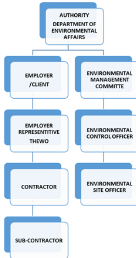
Figure 1: EMP implementation organisational structure.