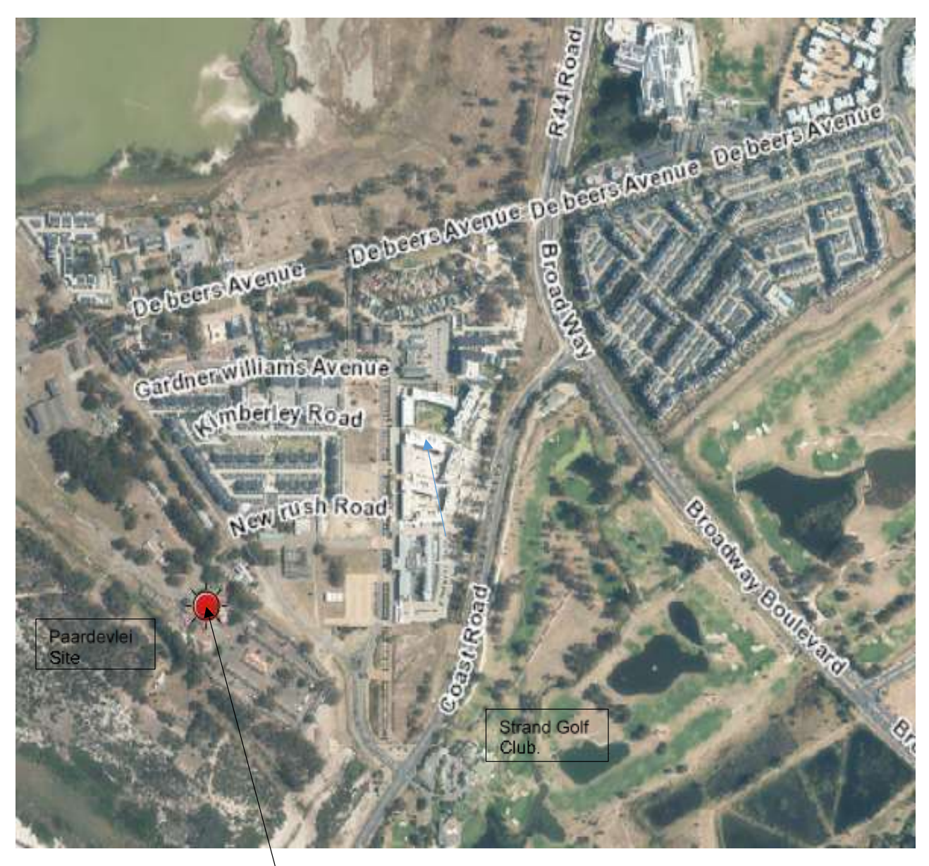
Site Clarification Meeting location as indicated