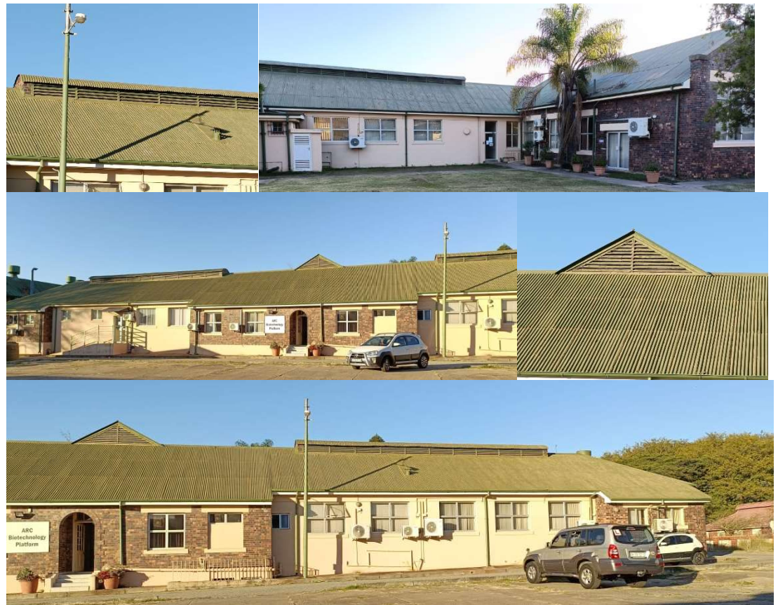
Figure 1. Biotechnology Platform building's roof, wooden louvres, gutters, downpipes and Fasi boards showing that will require cool surface prep and painting.

All measurements are indicatory and for suppliers to verify and measure during their mandatory site visit. The ARC will not be held liable for incorrect measurements.