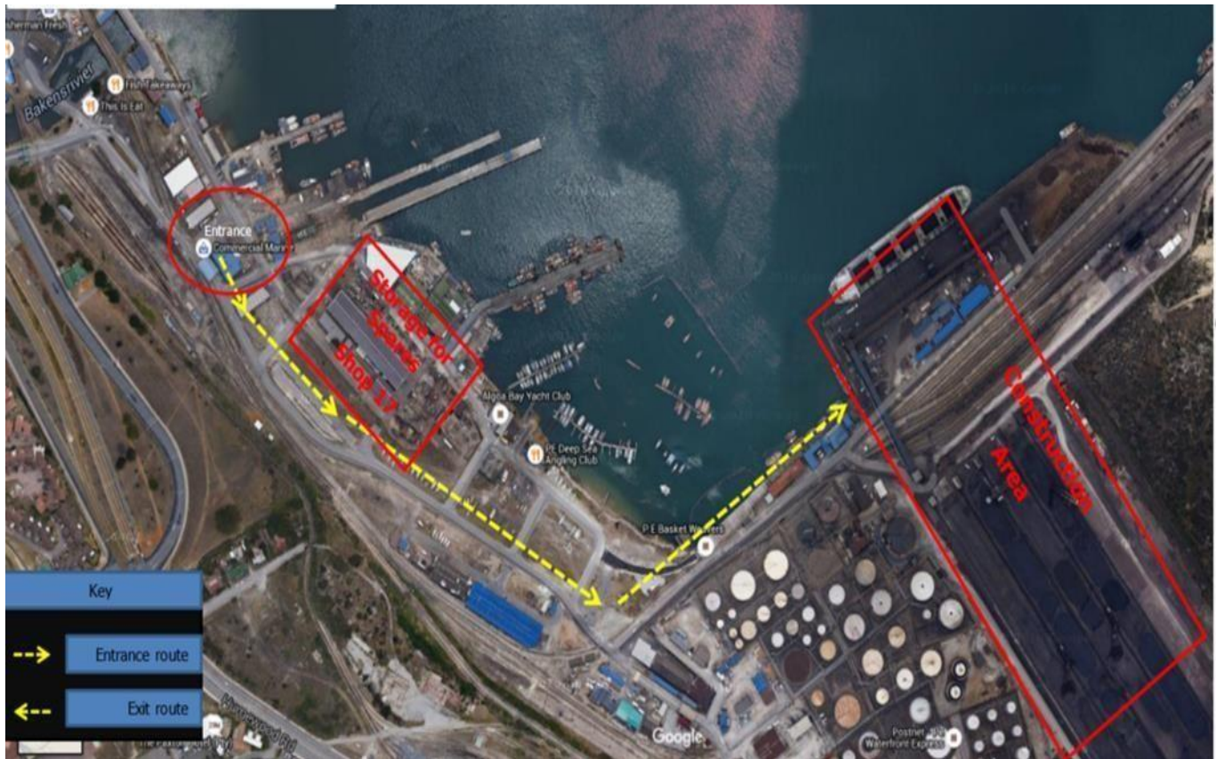
Figure 1 - Port Footprint