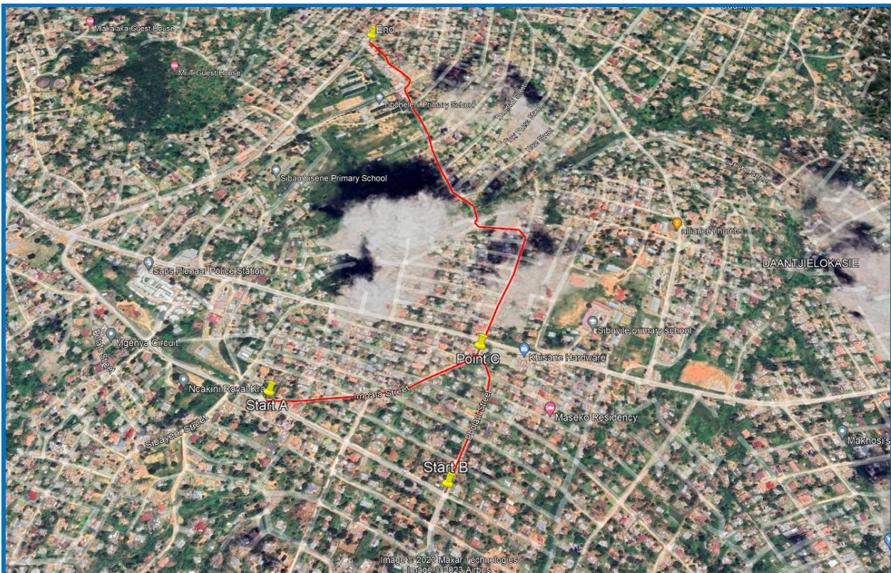
Figure 1: Locality Plan of the Project Areas

The start of the road is at Lat: 25°26'12.92"S, Long: 31°11'14.45"E and ends at Lat: 25°25'37.10"S Long: 31°11'20.43"E.. The road crosses a major stream on one of the streets, named Come Duze Street. The road to be upgrade starts at the surfaced Khekhe Road, then intersects an unnamed Provincial Road and end at Nkomene Road. The approximate length of the road is 2.1km. The locality plan is presented in Figure 1 below.