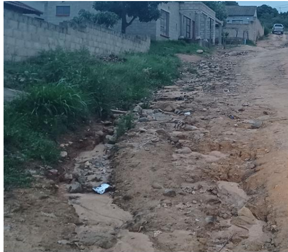
Figure 1-Severe erosion on the road