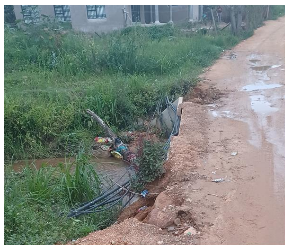
Figure 3-Vertical displacement of the structure