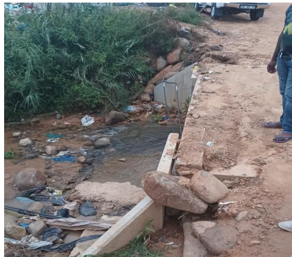
Figure 2-Horizontal movement of the structure