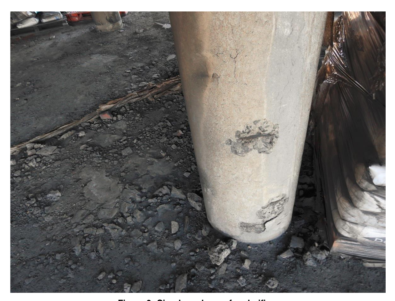
Figure 3: Circular columns for clarifiers