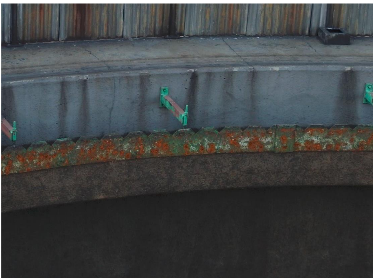
Figure 2: Internal structure for clarifiers

The WTP as shown in the figures above consists of a structural steel frame and reinforced concrete structure. The Clarifiers are supported over a grid of reinforced columns and beams, with a shell of reinforced concrete walls and steel handrailing at the top. The function of the clarifier tanks is to remove sediment from the raw water.