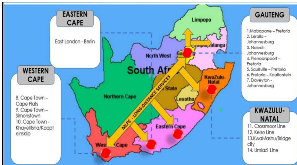
Figure 1: National Corridor Diagram

The 15 corridors (including Western Cape Region) are as below: