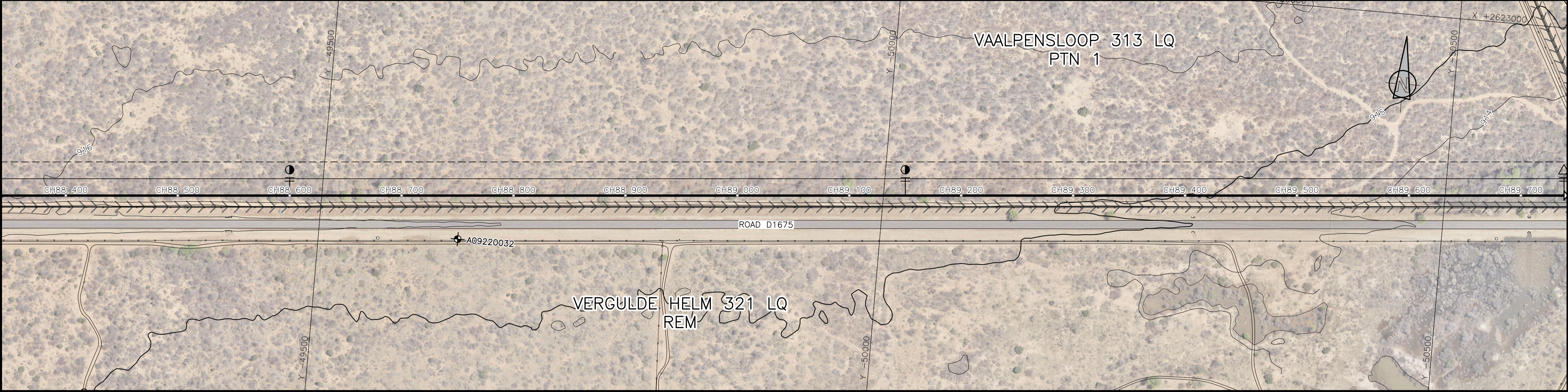
PLAN SCALE 1:2000