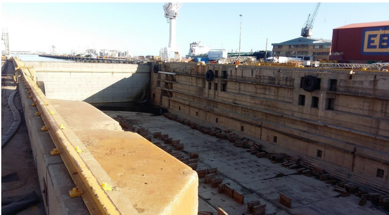
Figure 1-3: Sturrock Dry Dock overview