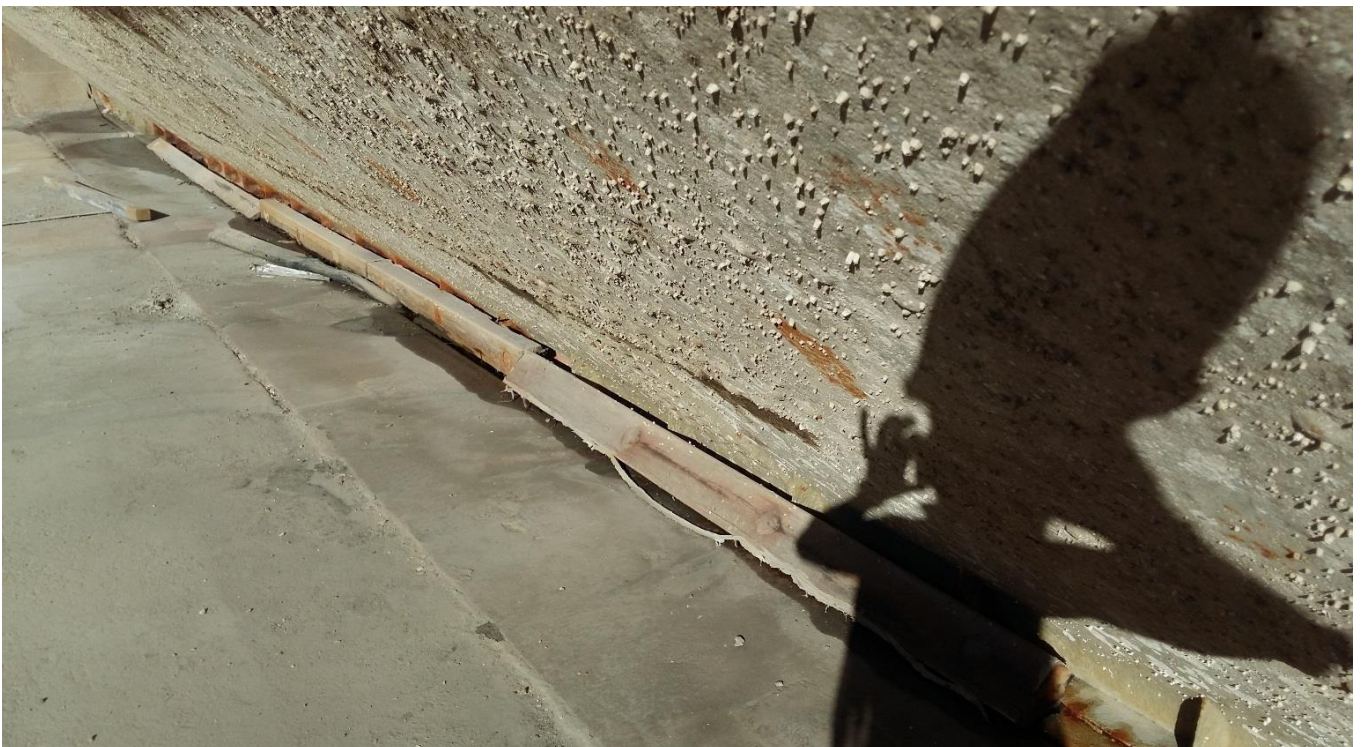
Figure 1-5: planks used as temporary stoppage or seal for caisson gate