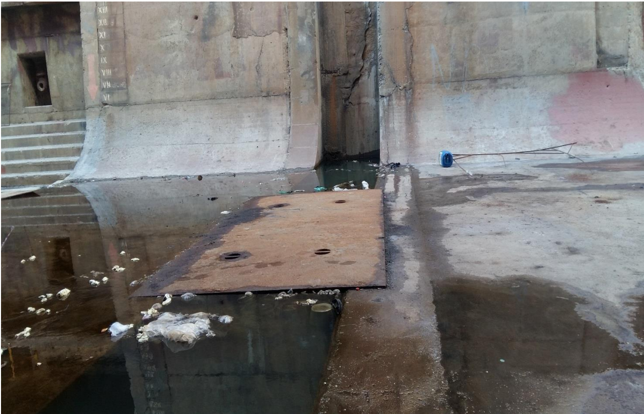
Figure 1-9: groove filled with water and debris