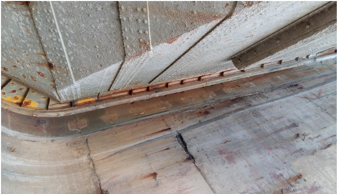
Figure 1-6: overview of caisson gate seal against caisson groove