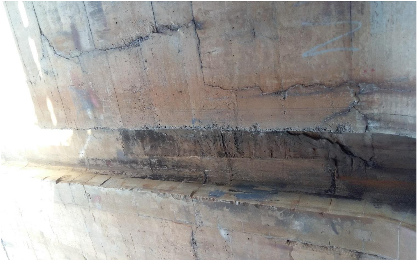
Figure 1-1: cracks showing from the vertical side of caisson groove

The Project Management Office of Transnet National Ports Authority (TNPA) is currently in the process of designing the inner caisson gate for Sturrock Dry Dock. However, there is significant concrete and granite deterioration/edge breaks at the intermediate caisson gate grooves. The cracks in the concrete surface are likely contributing to the dock gate leaks and is ultimately affecting operations of the dock. As part of the quality assurance and compliance, assessments into the caisson grooves is required. The scope outlined below shows the need for assessment of the existing two caisson grooves condition which include a repair specification with testing procedures and proposed execution methodology on how to repair the structure. The supplier is required to provide relevant bill of quantities for caisson groove repair works.