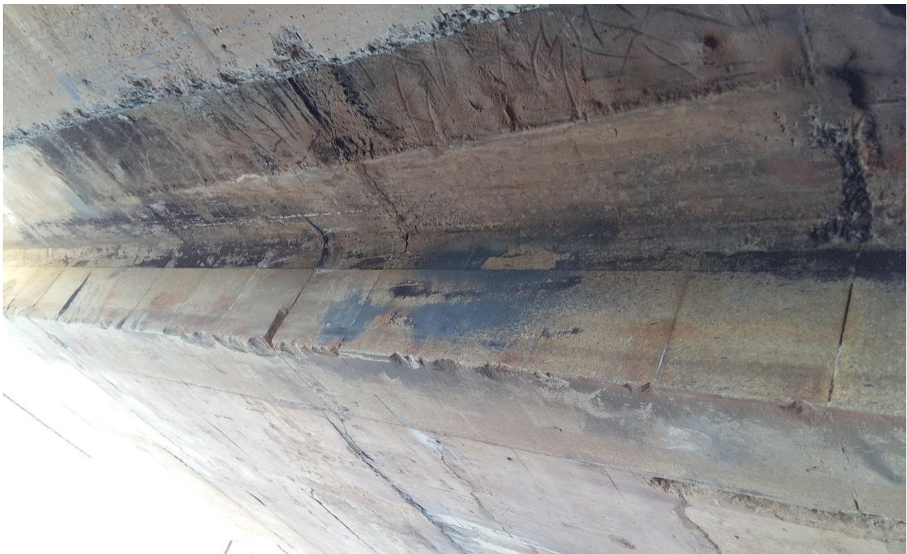
Figure 1-7: granite and concrete deterioration in the caisson gate