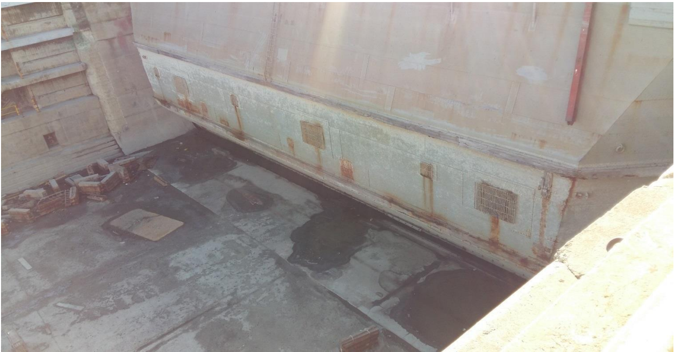
Figure 1-4: caisson gate showing some water leakage