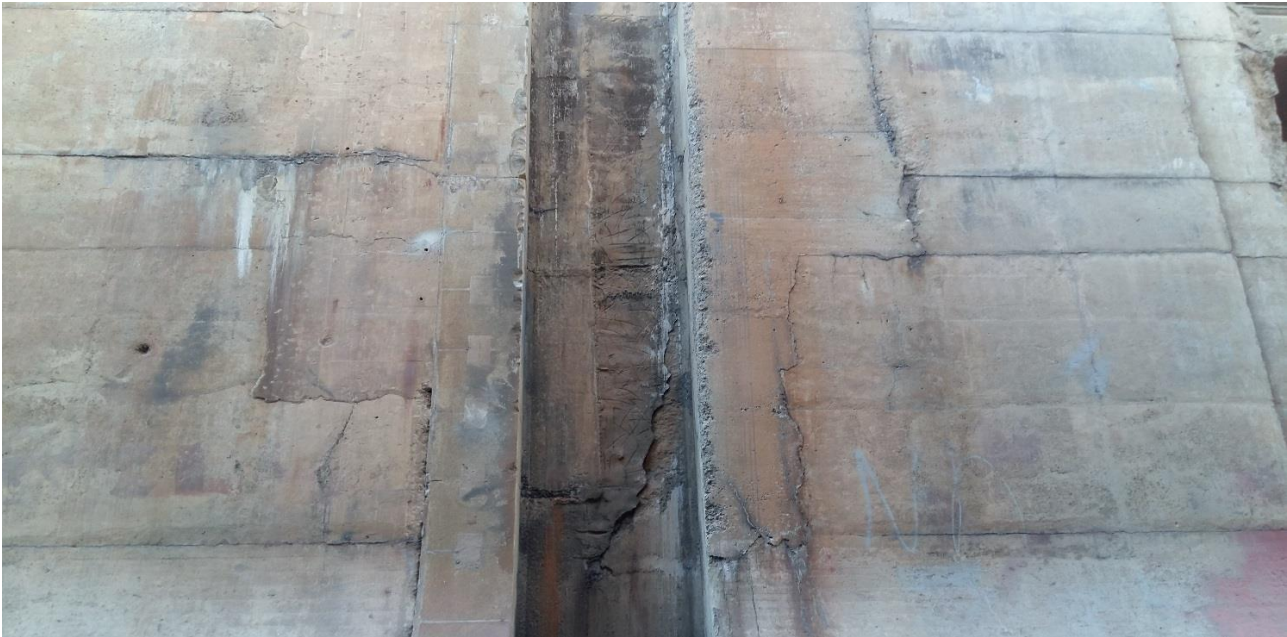
Figure 1-8: surface deterioration inside the caisson groove